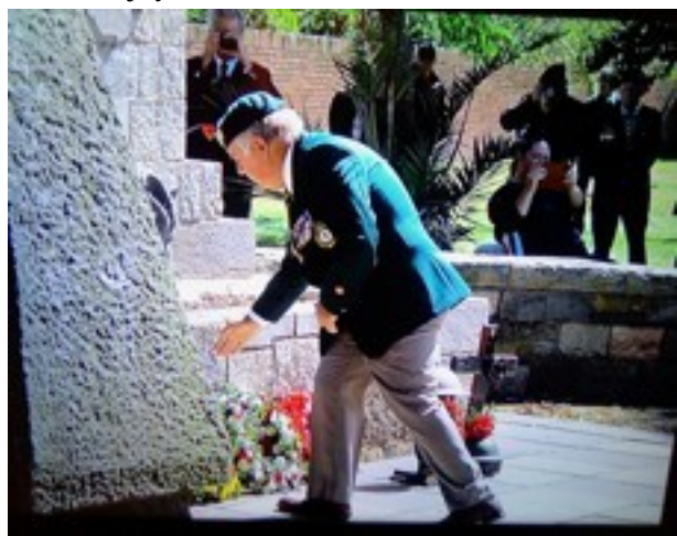
SA Legion Branch Chairman laying a wreath.

after the parade where harmony and comradeship can be enjoyed.