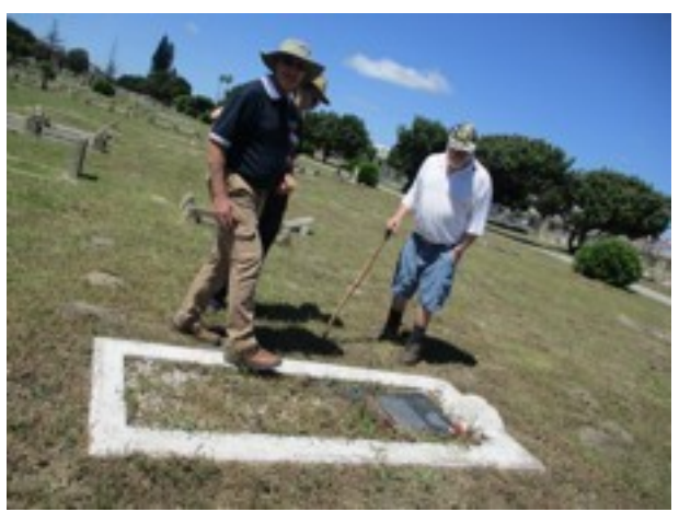
Anglo Boer War Rebel's Grave